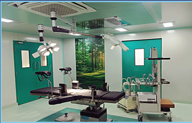
Designer Modular OT with ADF (4ft. x 3ft.)