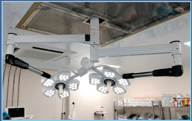
Regular Modular OT with ADF (6ft. x 4ft.) Complete disinfection of OT