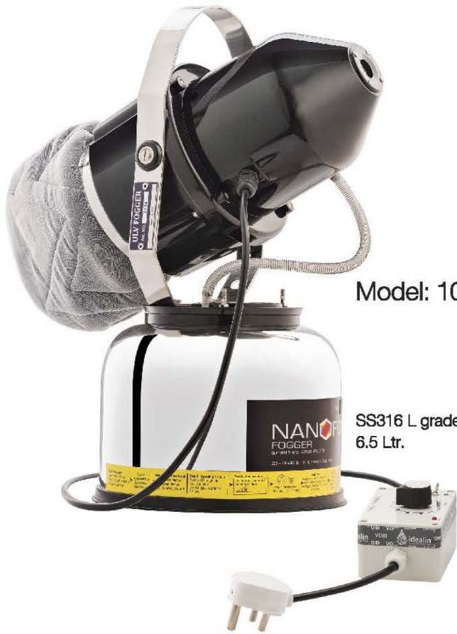
Model: 1020 SE