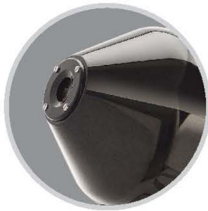
Engg. Plastic Nozzle Assembly