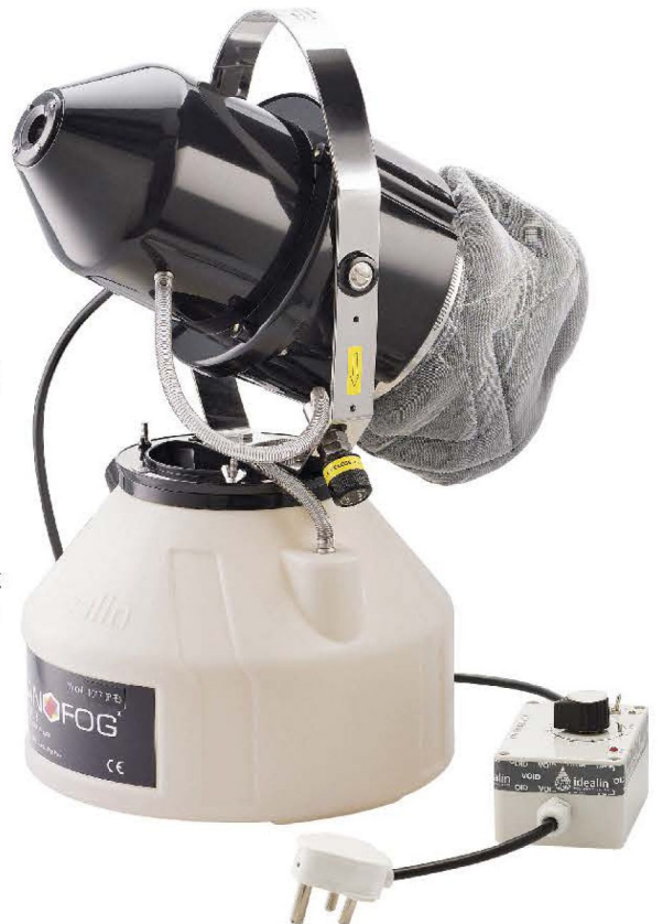
Model: 1017 PFE