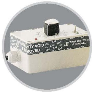
Electronic Timer (Adjustable 5 ~ 60 Minutes)