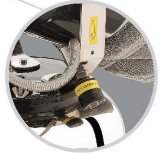
SS304 Grade Flow Control Mechanism