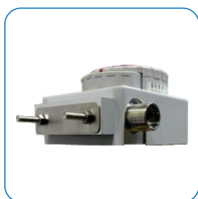
Cagemount Type mounting option