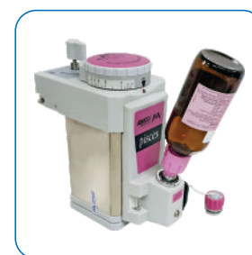
Meditec Fill® safe filling option