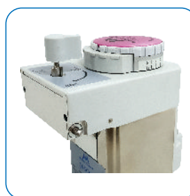
Selectatec® with Interlock mounting option