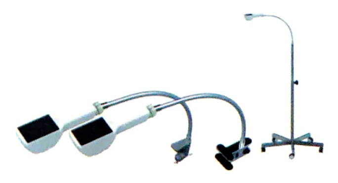
Table Clamp / Flexible Clamp / Roller Stand