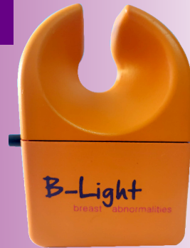
B-Light an extremely useful device for breast self examination (BSE)

Breast cancer is the most common cause of cancer in women, both in developed and less developed world's. Each year thousands of cases are diagnosed of breast cancer. Most of them at late stage. Breast self examination ( BSE ) is very successful program.