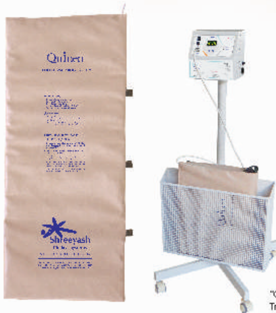
"QUINEN" with Trolley. Trolley, optional at Extra cost.

Clinical Studies have shown that the most important factor that caused Ischaemia is temp and exposure time. The lowest direct contact temperature responsible for a cutaneous burn in human is 44°C (Mortiz, 1947) with irreversible injury occurring after six hours of exposure, below this threshold temperature blood flow to the tissue tends to affect temp. distribution in the skin only slightly. However, once the threshold temperature has been reached Ischaemia caused by pressure or surgical techniques may well increase the rate at which injury occurs. Also higher temp. setting may cause injury in short time.