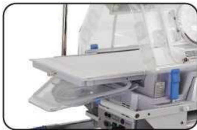
Side door open

">37°C" override temperature mode, Disposable skin temperature sensor, Ambulance trolley.