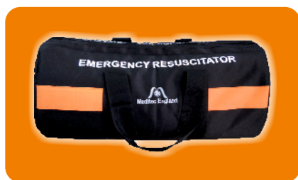
Dust Proof Carry Bag