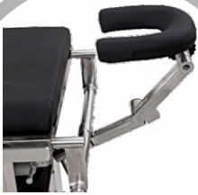
Horse Shoe Neuro Attachments