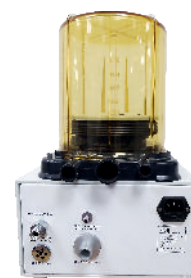
Allied Jupiter Ventilator Rear View with adult bellow