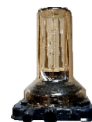
Pediatric Bellow (Optional)