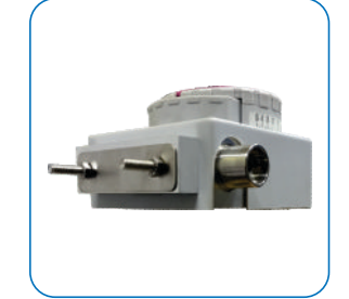
Cagemount Type mounting option