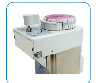
Selectatec® with Interlock mounting option