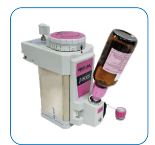
Meditec Fill® safe filling option