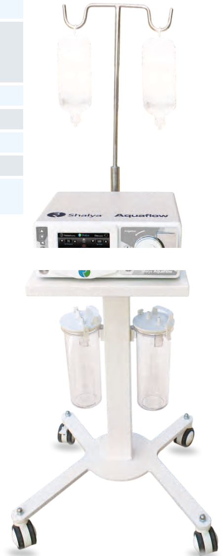
Suction Irrigation System with Trolley