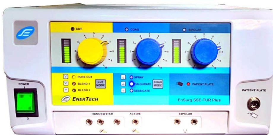
Ensurg SSE - TUR Plus

Enertech providing its widest range of high performance state of the art COST EFFECTIVE Electro Surgical Generators available today in the market. The machines come with Instant Tissue response technology and Tissue impedance measurement systems. These models offer top of the line features like 99 program modes, multiple blend modes, endo cut facility, best monopolar cutting and coagulation performance with precision controlled bipolar output and host of safety features with adherence to EC 60601 guidelines. The range also includes low cost analog models for price conscious customers.