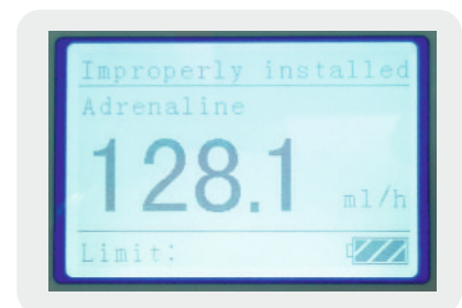
HD LCD Display