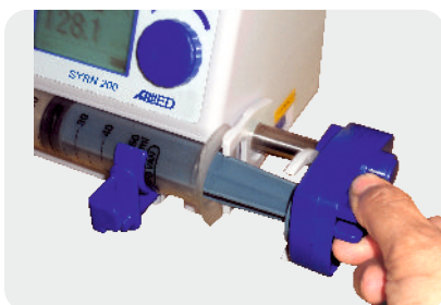
Single Hand Operation