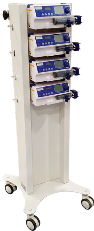
Docking Station (Optional)