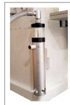
Active AGSS System (Optional)