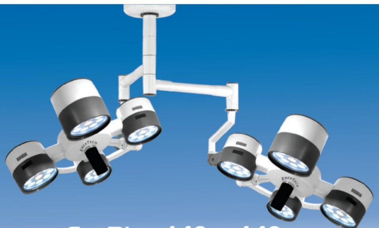
EcoPlus 140 + 140