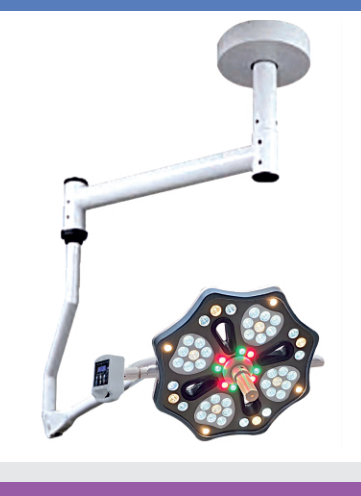
Model: Blitz Crescendo-S