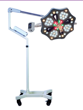
Model: Blitz Crescendo-M