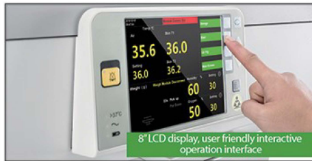
8" LCD display, user friendly interactive operation interface