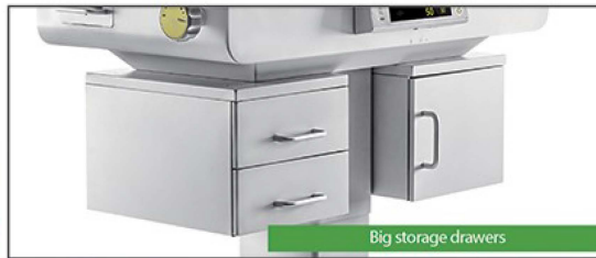
Big storage drawers