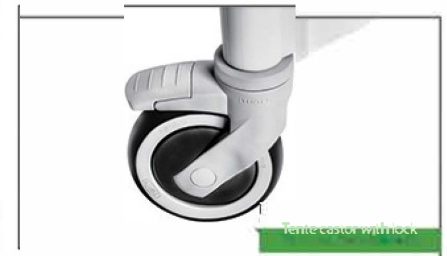
Tente castor with lock