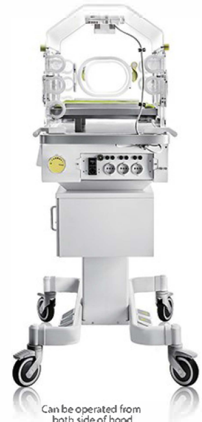
Can be operated from both side of hood