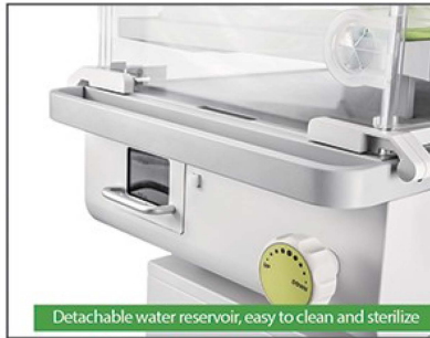
Detachable water reservoir, easy to clean and sterilize