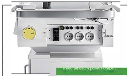
Three auxiliary power output