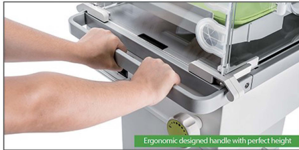
Ergonomic designed handle with perfect height