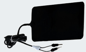
Silicon Patient Plate ( Optional )