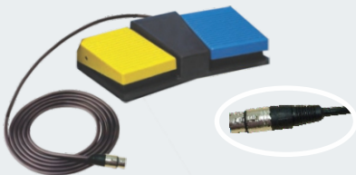
Monopolar Double Pedal Footswitch / Bipolar Single Pedal Footswitch