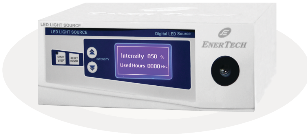
LED Light Source