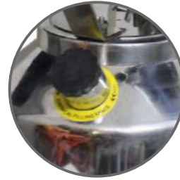
Chemical Filling Space