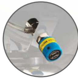
Flow Control Mechanism